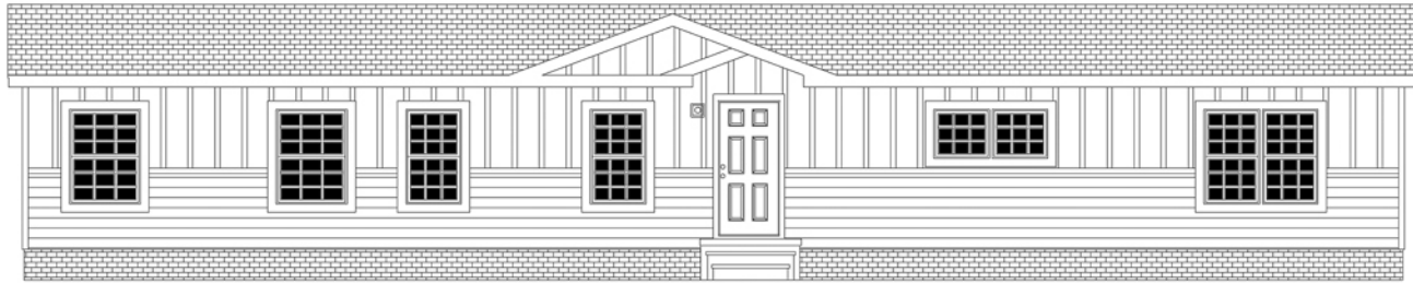
OPTIONAL SANTA FE EXTERIOR